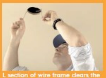
L section of wire frame clears the underside of the ceiling and fits into place excess is removed.