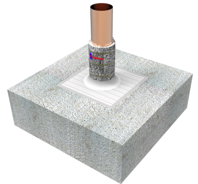
COPPER PIPES FRL up to -/120/120 with FyreWrap Insulation System *

ALSO AVAILABLE – Trafalgar offers a complete range of other fire stopping and fireproofing products.